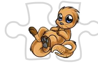
Otters in your Sphere of Influence