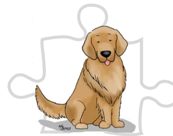
Retrievers in your Sphere of Influence